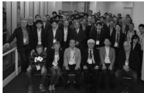
Fig. 2. Photograph of XOPT2017.

Monochromatic figures are recommended. Color figures or photographs can be used, but please note that the book of Abstract will be printed in black and white. A caption should be attached to each figure and table. An example is shown in Fig. 2.