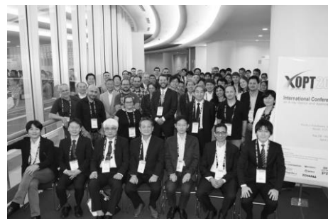
Fig. 2. Photograph of XOPT2018.

Monochromatic figures are recommended. Color figures or photographs can be used, but please note that the book of Abstract will be printed in black and white. A caption should be attached to each figure and table. An example is shown in Fig. 2.