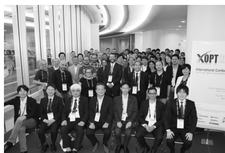
Fig. 2. Photograph of XOPT2018.

Monochromatic figures are recommended. Color figures or photographs can be used, but please note that the book of Abstract will be printed in black and white. A caption should be attached to each figure and table. An example is shown in Fig. 2.