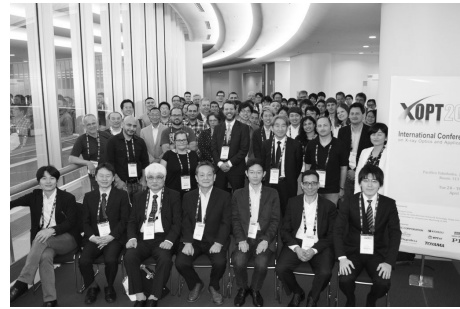
Fig. 2. Photograph of XOPT2018.

Monochromatic figures are recommended. Color figures or photographs can be used, but please note that the book of Abstract will be printed in black and white. A caption should be attached to each figure and table. An example is shown in Fig. 2.